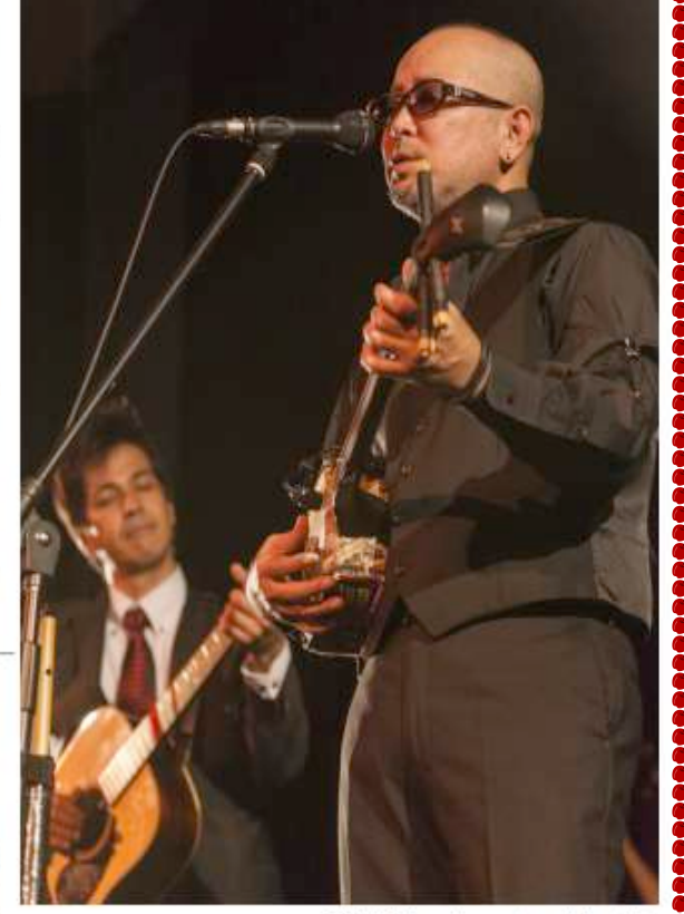
SAKISHIMA meeting, courtesy of the artists